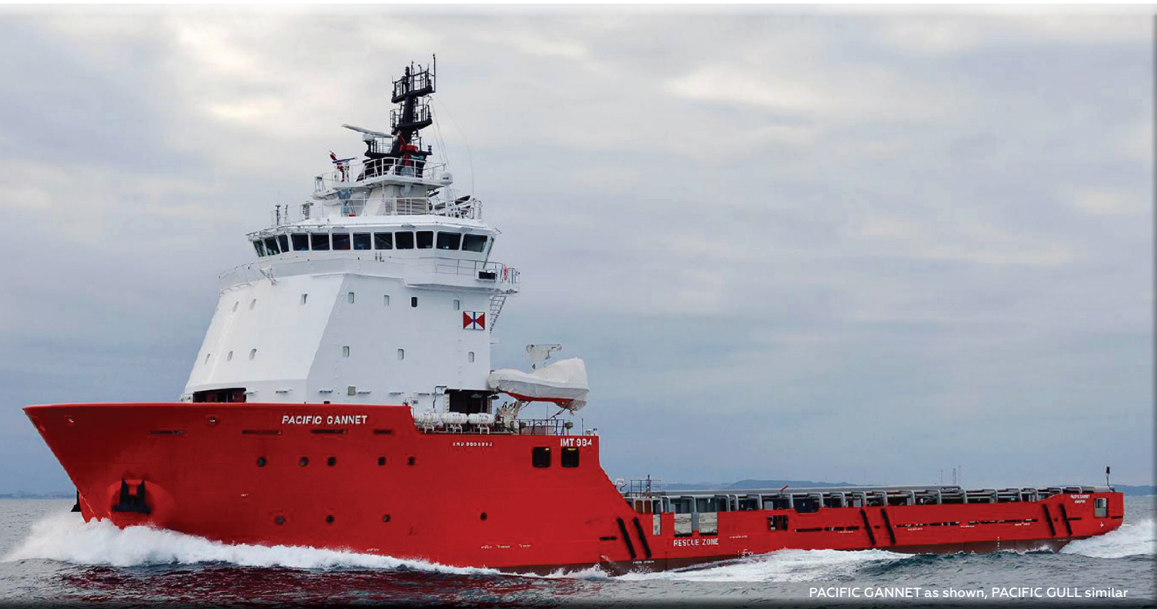
PACIFIC GANNET as shown, PACIFIC GULL similar