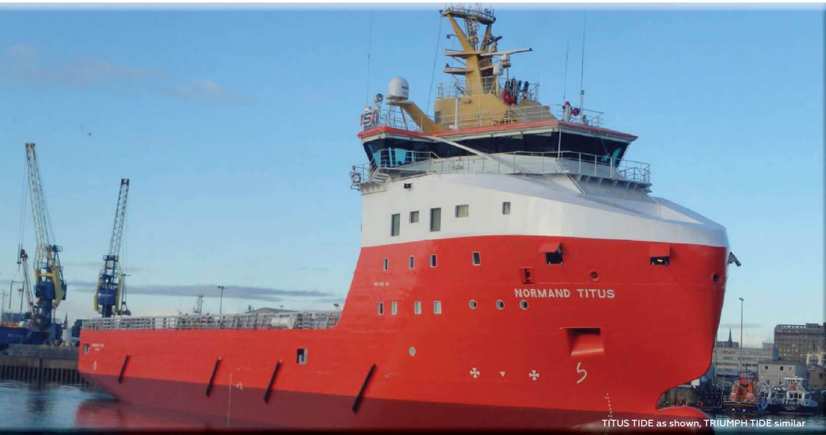
TITUS TIDE as shown, TRIUMPH TIDE similar